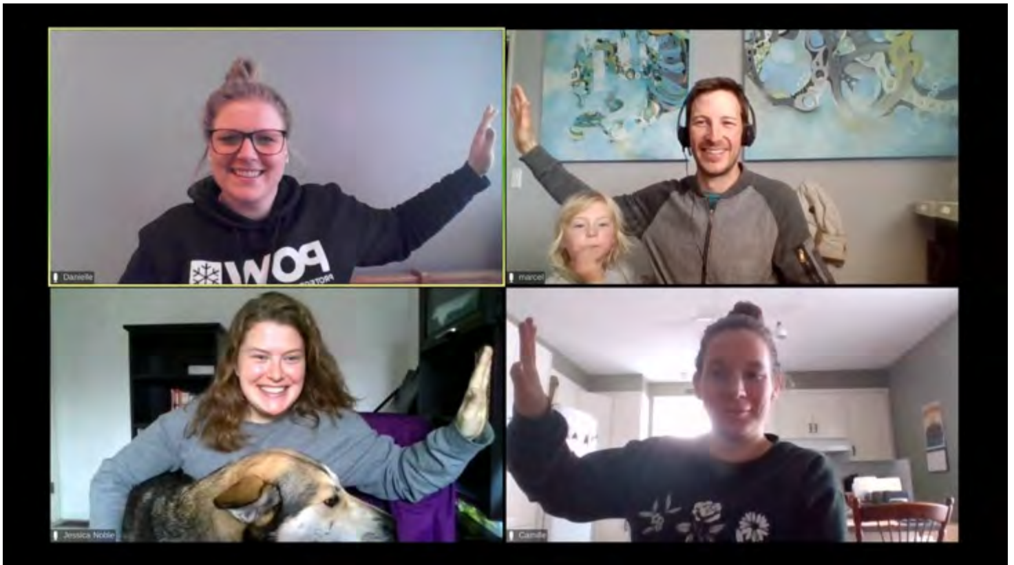
2022 National Trainers

Hello! It is our pleasure to introduce ourselves to you as CISV Canada's NLTC. Our job is to train all the leaders that CISV Canada sends internationally and nationally every year. We plan and run the national trainings that occur in the spring of each year, and ensure that our training materials are to the current international standards.